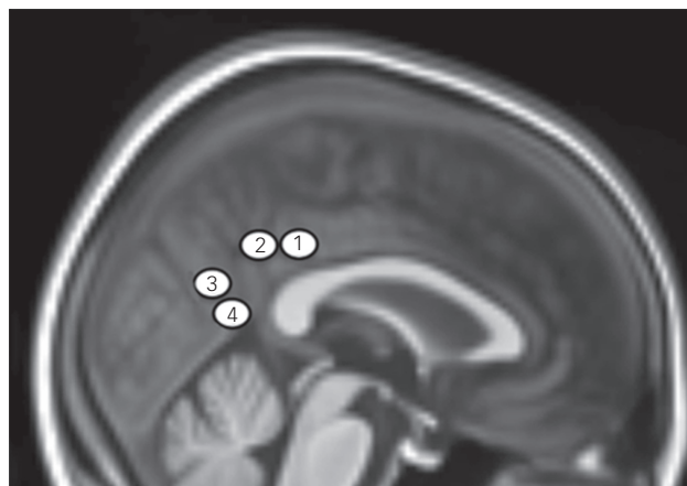
Fig. 1 Placement of the posterior cingulate cortex seed regions of interest on a 2 mm resolution anatomical study-specific template.

Functional connectivity maps were estimated for each PCC region for each participant by including the PCC time series and nuisance signals as predictors of interest and no interest, respectively, in whole brain, linear regression analyses in SPM8, conducted separately for each hemisphere. A high-pass filter of 128 s was used to remove low-frequency drifts. Each of the three nuisance covariates were fully orthogonalised and then removed from each seed's time series along with six head-motion parameters (3 translation, 3 rotation estimates) by linear regression, resulting in a general linear model that comprised four 'noise-